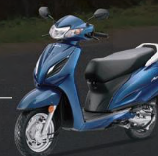
Pearl Siren Blue