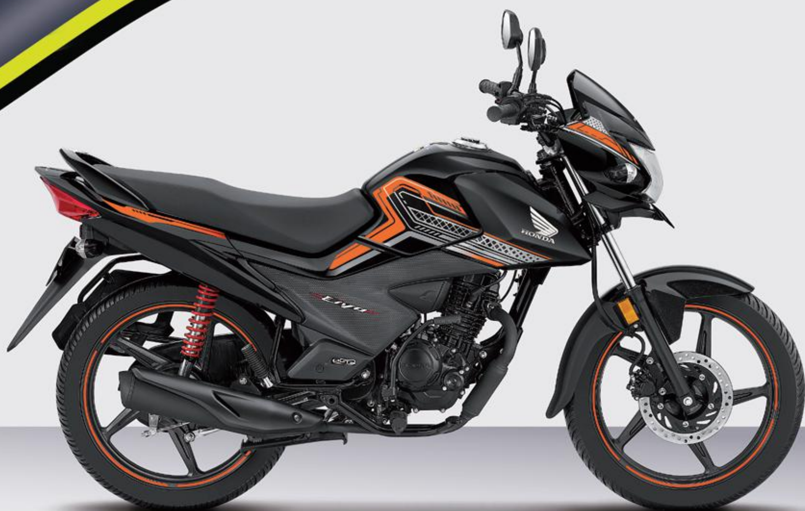
PEARL IGNEOUS BLACK (Pearl Igneous Black Shroud + Orange Stripes)